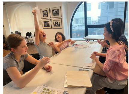
"Dragon Class" (飞龙班) for teens, Immersive Mandarin Summer Program 2025

China Institute Hoppy Rabbit Playdate program offers 1.5 hours open session where families can bring their children to our spacious and cozy indoor playground space to play, socialize, have fun with age-appropriate toys and activities. This is also a great time to meet children and families interested in exploring Chinese language and culture. All families are welcome!