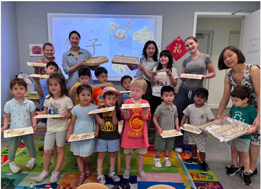
A dumpling workshop, Immersive Mandarin Summer Program for children, 2025