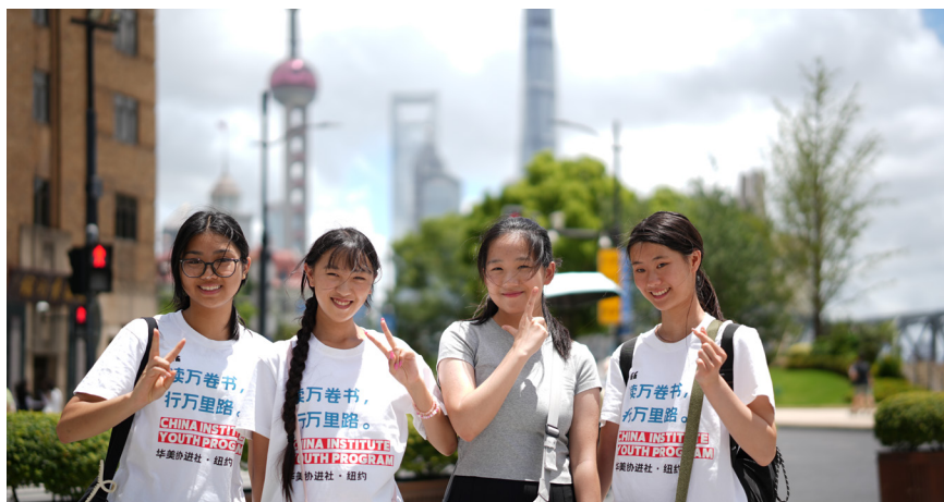
Shanghai, SHC 2025