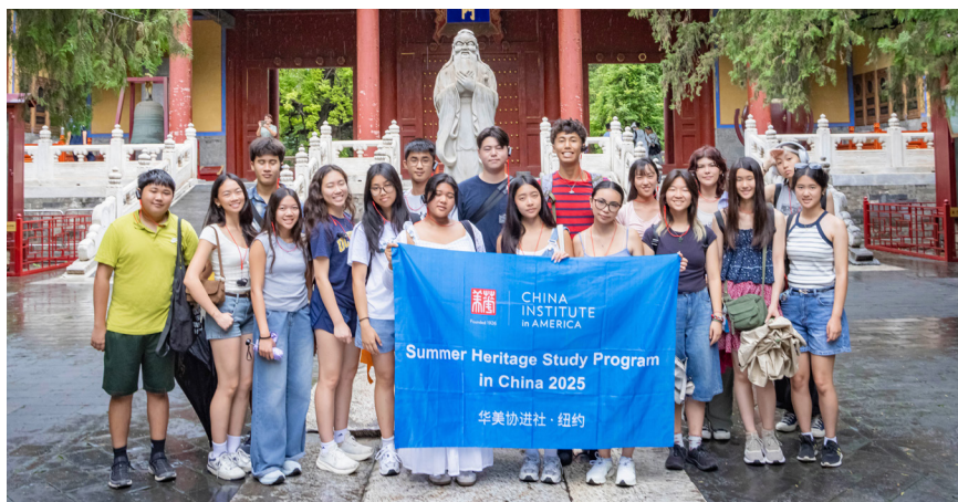
Confucius Temple, Beijing, SHC 2025

This program is made possible through the generous support of the Tsao Family Foundation.