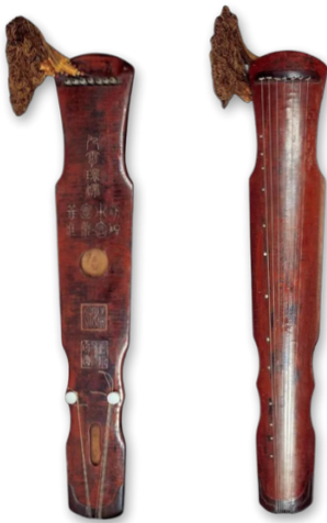
Qin, "Celestial Chimes in the Ninth Heaven" (九霄环佩, Jiu Xiao Huan Pei ), Tang Dynasty (618 - 907 CE), Fuxi Style, lacquered wood, silk strings, crafted by the Lei family. The National Museum of China.

At Guqin Intermediate students learn to read more advanced tablatures (notation), correct hand postures, and more complex fingerings (separate, advance and return, back and return, lift, knock, push out, etc.) as well as two or more intermediate-level pieces.