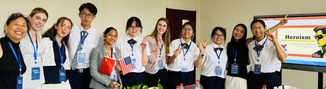
Youth Forum: One World Our Future, Taiyuan, YLC 2025