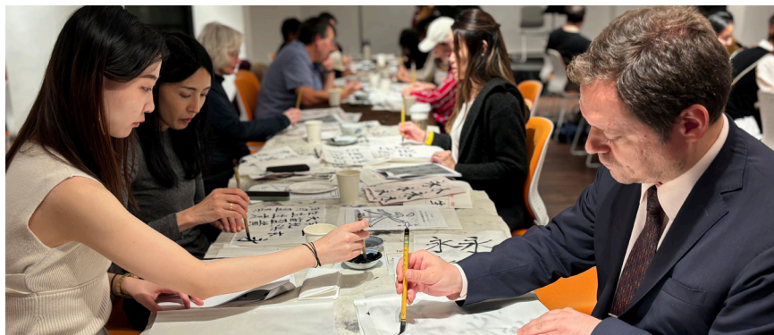
Calligraphy, Music and Mandarin Meetup 2025