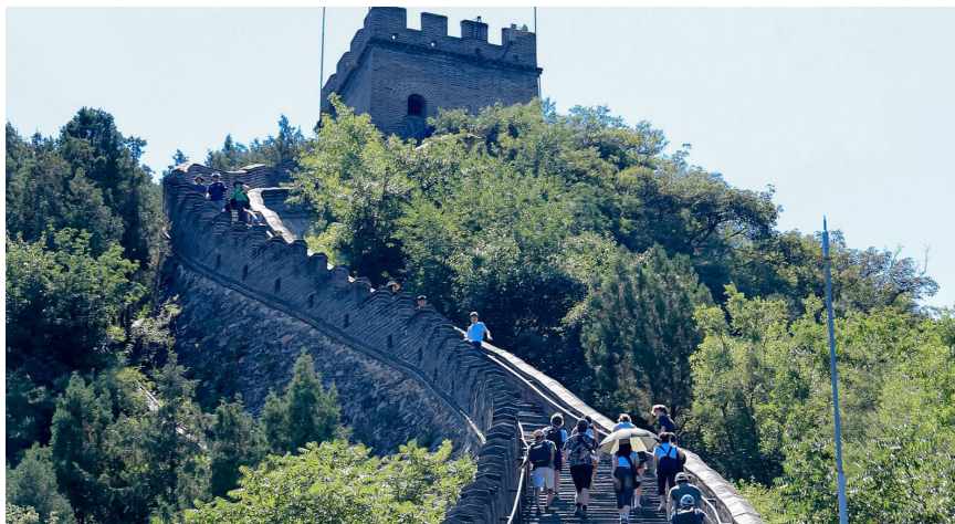
YLC students on the Great Wall, Beijing, 2024

This enriching two-week study tour connects American high school students with their Chinese peers through collaborative projects, cultural exploration, and shared experiences. The Youth Leadership Program in China (YLC) is an annual initiative dedicated to fostering mutual understanding between the United States and China through meaningful people-to-people exchanges. A highlight of YLC is the international youth forum “One World, Our Future”, where students engage in dialogue and present their vision for a more connected and harmonious world.